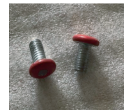
M5 screw (x14)