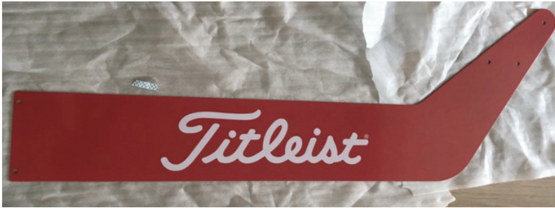
Left side panel (x1)