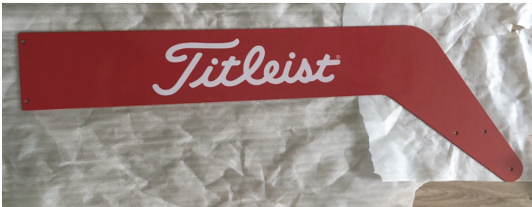
Right side panel (x1)