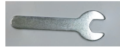
Big wrench (x1)