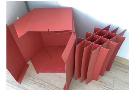
Card board (x1)