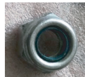
Lock nut (x2)