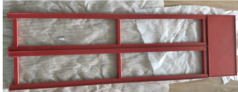
Back frame (x1)