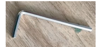
L shape wrench (x1)