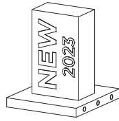
"NEW" MODULE (x1)